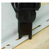
Vinyl siding tip available FSM40V